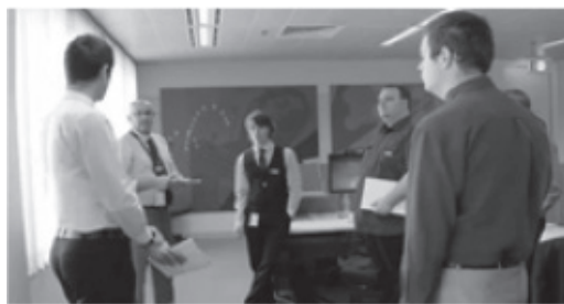
Morning Scrum, Adelaide